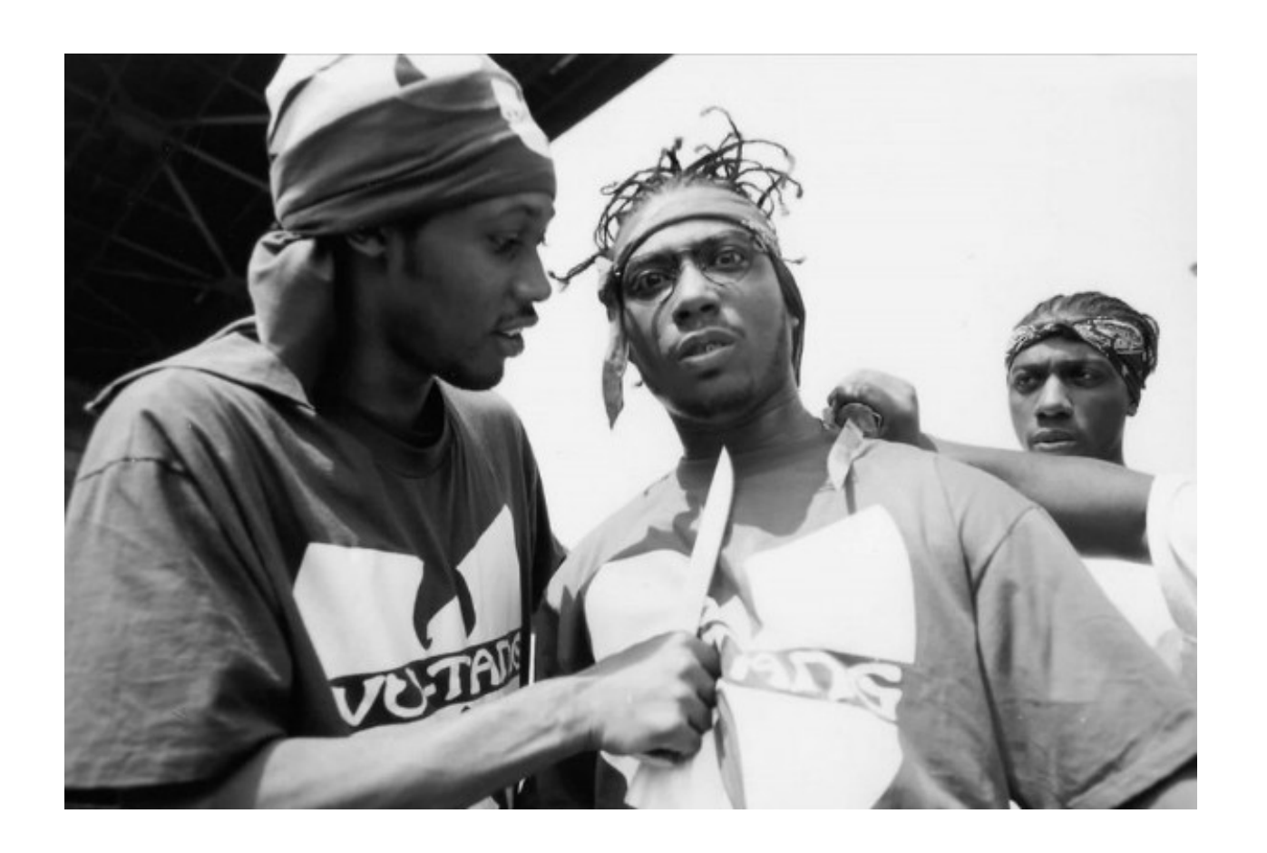
RZA putting a knife up to ODB's throat. ODB or Ol Dirty Bastard died at RZA's recording studio in 2004. RZA sacrificed ODB.