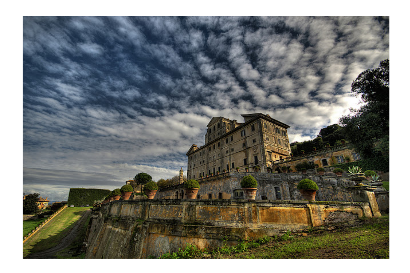
Aldobrandini Villa is very creepy.